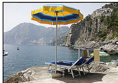
From lounge chairs on the beach or hilltops in town, Praiano shimmers by the sea.

By Nicole Cotroneo Special to The Washington Post Sunday, April 15, 2007