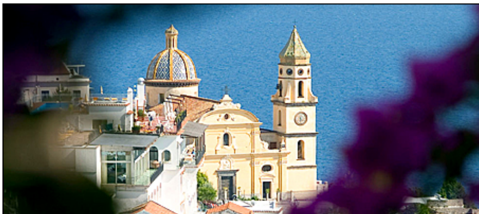
Peer into Praiano, Italy, and its breathtaking sights.